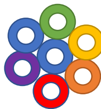
Hula Hoops – Target Circle